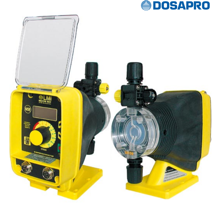
Programmable electronic dosing pump LMI series AA9